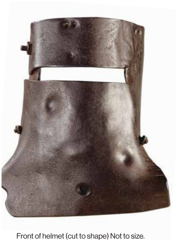
Front of helmet (cut to shape) Not to size.

Primary School visitation resource (available for each student upon request.)