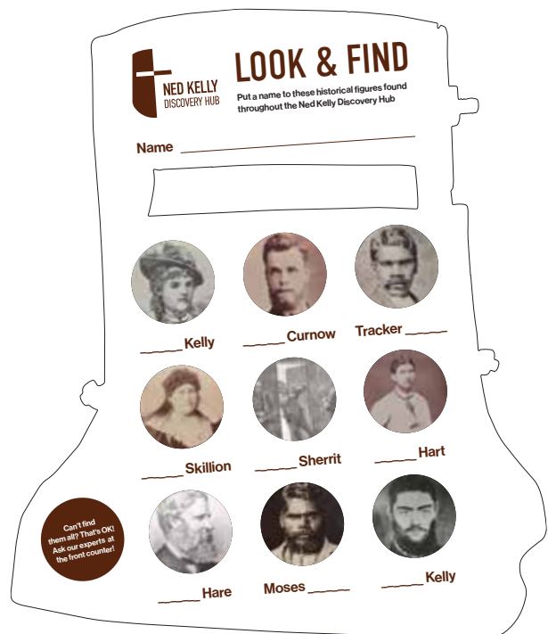
Back of helmet (cut to reverse shape) Not to size.

Printed in colour and on thick paper. Children can write their name at top and either tick the blank space or write in the name they find as they find each image.